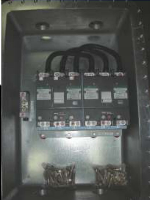
Explosion Proof 600 Amp Transfer Switch