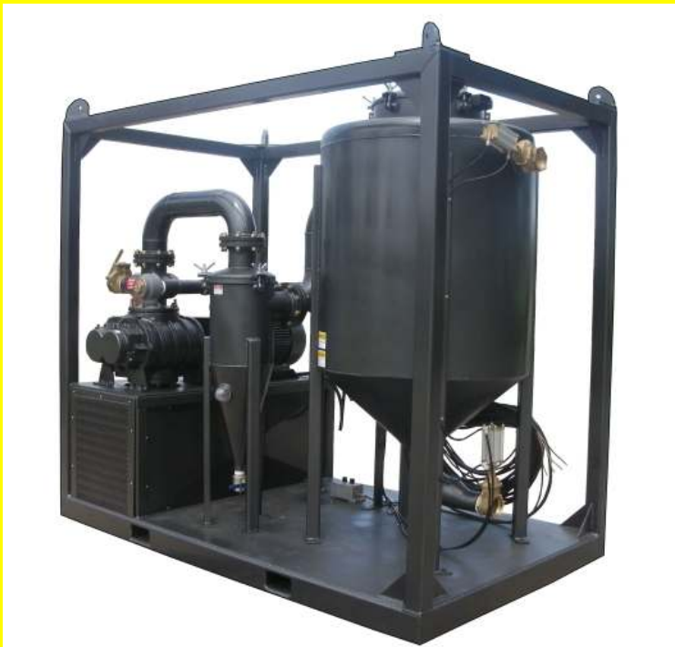
Industrial Vacuum 50 HP Explosion Proof