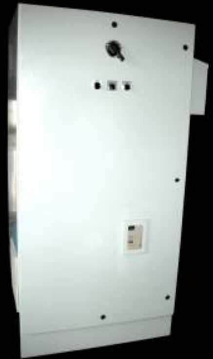
VFD Drive Rental