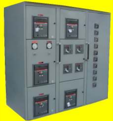
Main tie main marine Board built in 7 days from purchase order

Explosion Proof Fiberglass Stainless Steel Painted Steel With Starters Specific Dimensions Retrofits Power Buildings Rentals