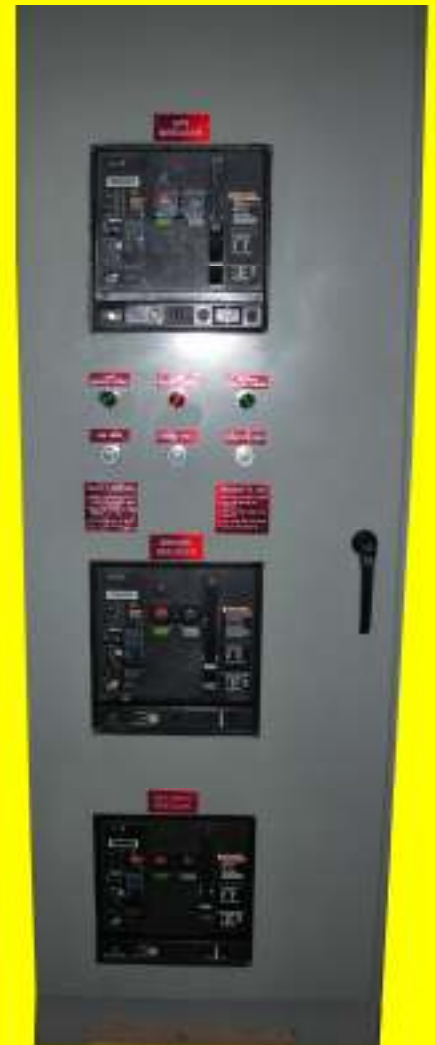
Maintenance bypass switch 2000 amp drawout