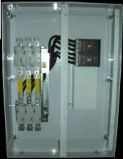
Transfer Switch with Built in Distribution

Explosion Proof Fiberglass Stainless Steel Painted Steel With Starters Specific Dimensions Retrofits Power Buildings Rentals