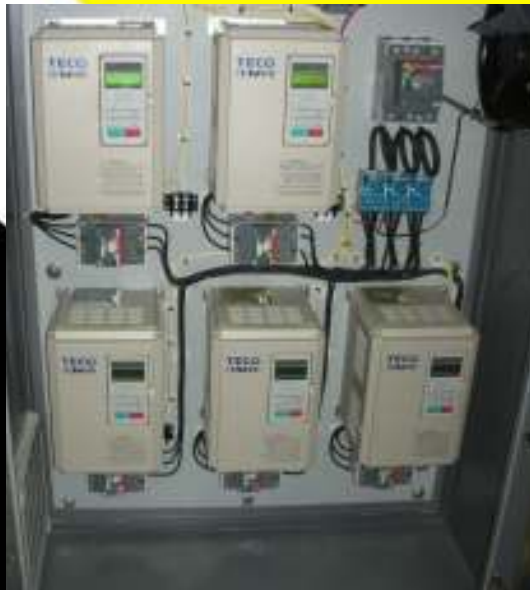
Drive with viewing window