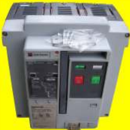
Circuit Breaker Rentals