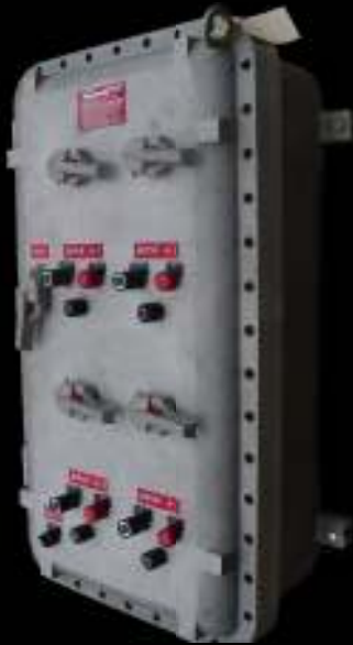
Explosion proof Panel Multistarter