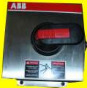
ABB no fuse stainless