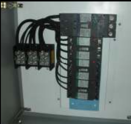
Distribution Block Panel (DBP) Smaller, Cheaper, Faster Delivery for panels That only need a few breakers 400 amp mlo 12 cirucits